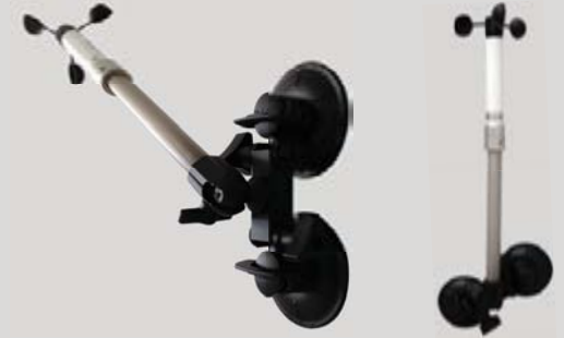
Blade tip anemometer