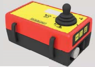
Remote control with display for axle pressure and wind speed